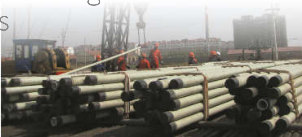
Shengli Oil Field Xinda Guanye S&T Development Co., Ltd., China

Lighter than steel, the development of next-generation fluid, oil and gas fiberglass-reinforced polymer (FRP) pipe infrastructure is an important global need to support the energy, water, sanitation and other industries.