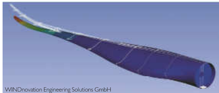
WINDnovation Engineering Solutions GmbH

For proven designs, WINDnovation used Ultrablade to substitute E-glass in order to reduce blade mass or to take advantage of the improved stiffness in order to extend the blades load envelope. Ultrablade also helps to make newly developed glass fiber blades possible whose lengths are heading towards 80m. This extends the application range of glass fibers into a market, until now, dominated by very expensive and delicate to handle carbon fiber.